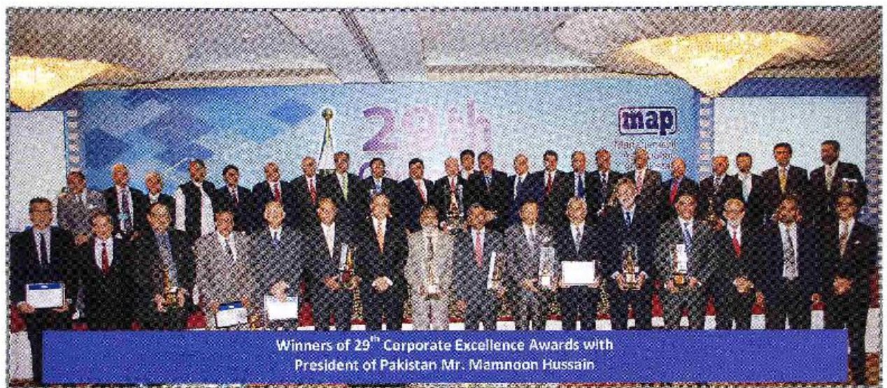
Winners of 29 th Corporate Excellence Awards with President of Pakistan Mr. Mamnoon Hussain