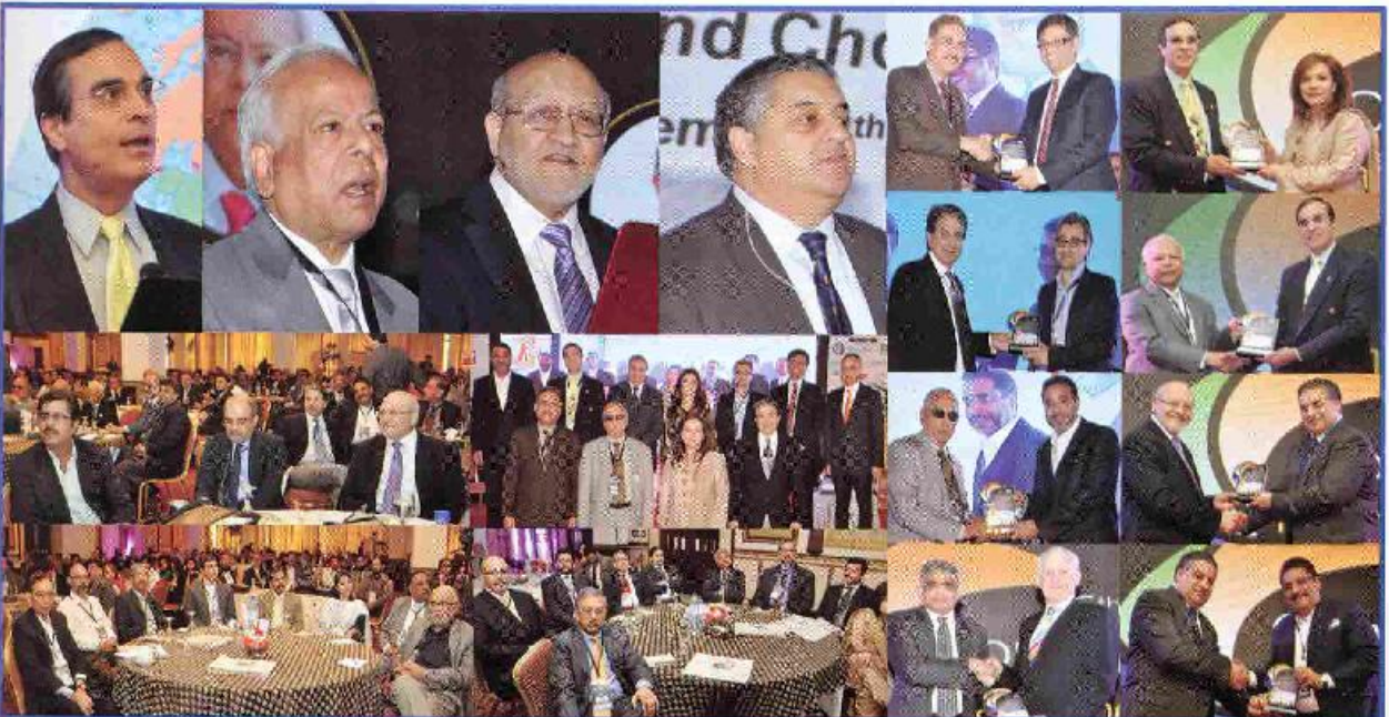
15 th MAP Convention 2013 held in Karachi on 4 th & 5 th December 2013