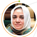
RABIA AZFAR NIZAMI Member of the Provincial Assembly of Sindh